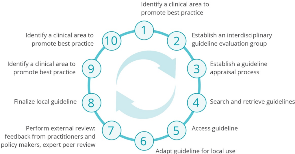
Practice Guideline Evaluation and Adaptation Cycle

The project leaders used the Practice Guidelines Evaluation and Adaptation Cycle (see diagram, below) as the model to evaluate and revise this guideline. The need and rationale for a guideline on pediatric concussion had already been established.